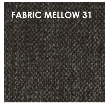
FABRIC MELLOW 31