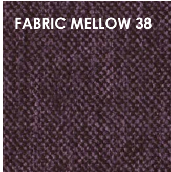
FABRIC MELLOW 38