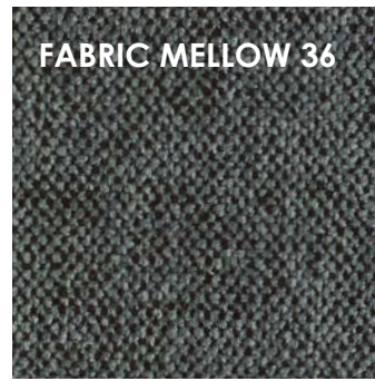
FABRIC MELLOW 36