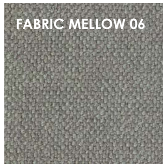
FABRIC MELLOW 06