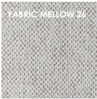
FABRIC MELLOW 26