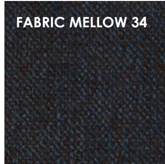
FABRIC MELLOW 34